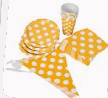
Our party supplies

Who's got the X Factor? Find out and ask for donations per entry.