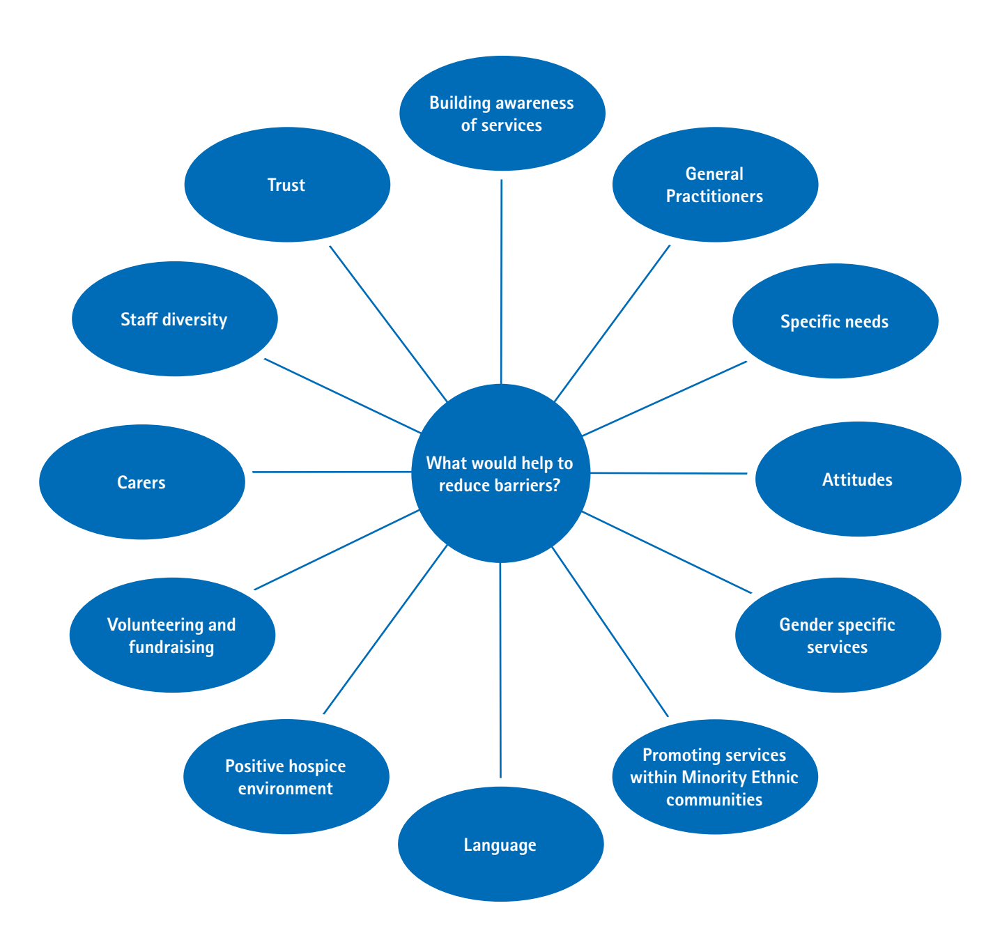
Diagram 2: Participants' views on how to reduce barriers to services

This chapter outlines some of the suggested solutions, based on the participants' responses and highlights key learning messages for Marie Curie and other healthcare providers.