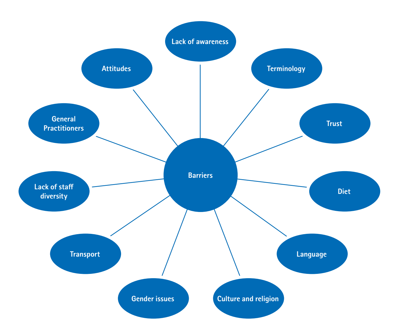
Diagram 1: Participants' perceived barriers to accessing hospice services

This chapter includes an assessment of each barrier, based on the participants' responses, together with a key learning message for Marie Curie and other healthcare providers.